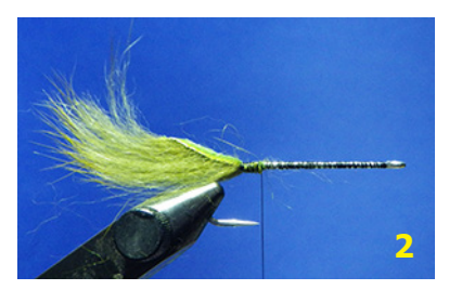
Tight Lines & Good Fishing