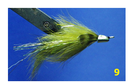
The Finished Fly